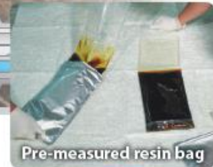
Pre-measured resin bag