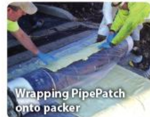
Wrapping PipePatch onto packer