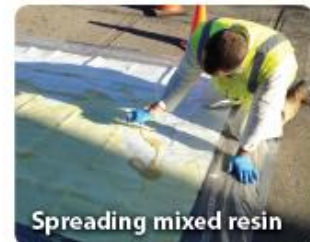
Spreading mixed resin